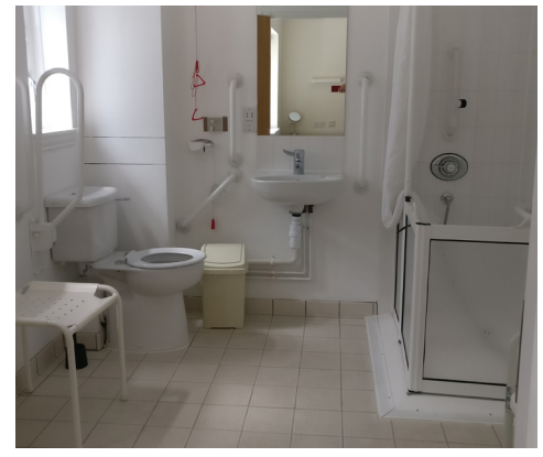
Accessible en-suite bathroom