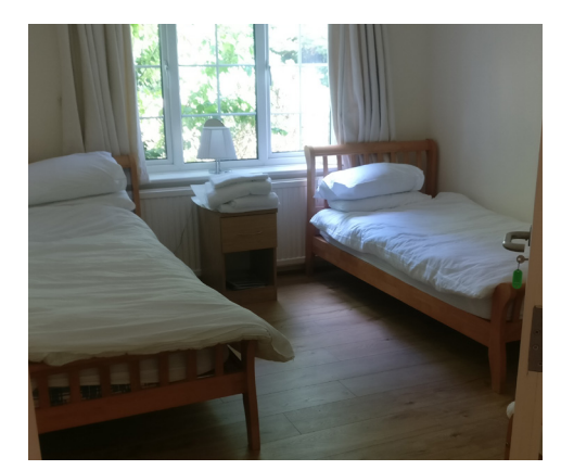
Ground floor bedroom in Redwood House