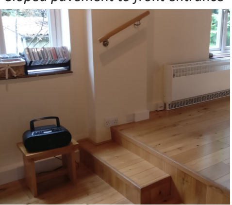
Chapel dais/sanctuary steps