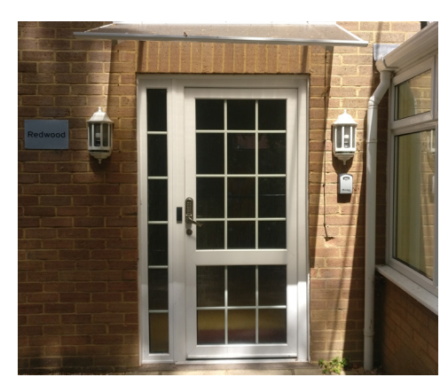
Redwood House front door