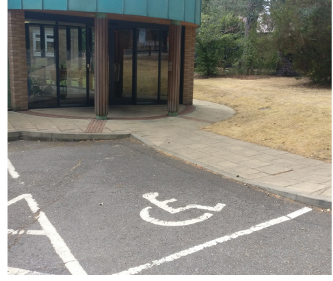
Drop kerb by disability bay