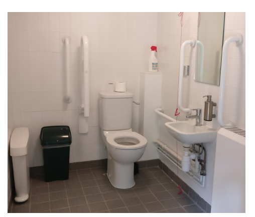
Accessible toilet on first floor