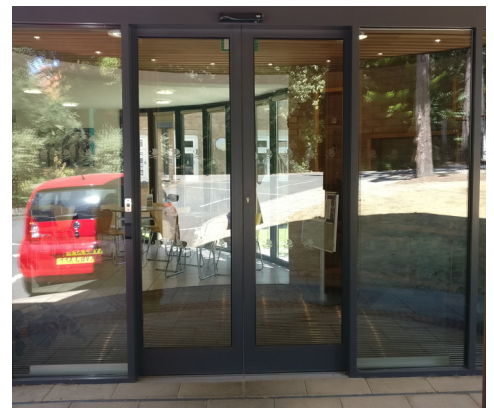
Front entrance doors