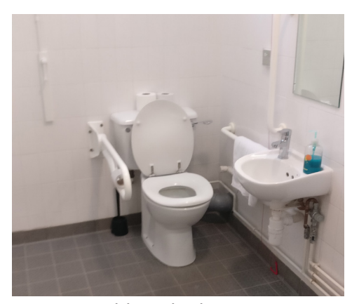
Accessible toilet by reception