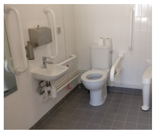
Accessible toilet by the Chapel