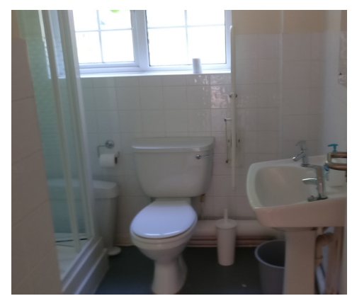
Ground floor bathroom in Redwood House