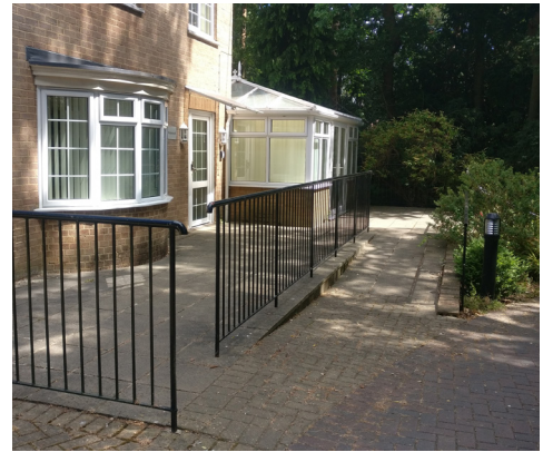
Slope access to Redwood House